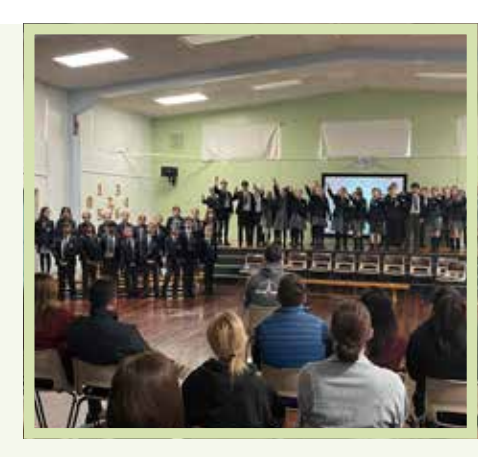
to fruition was an overwhelming joy, and I am unbelievably proud of every single one of them.